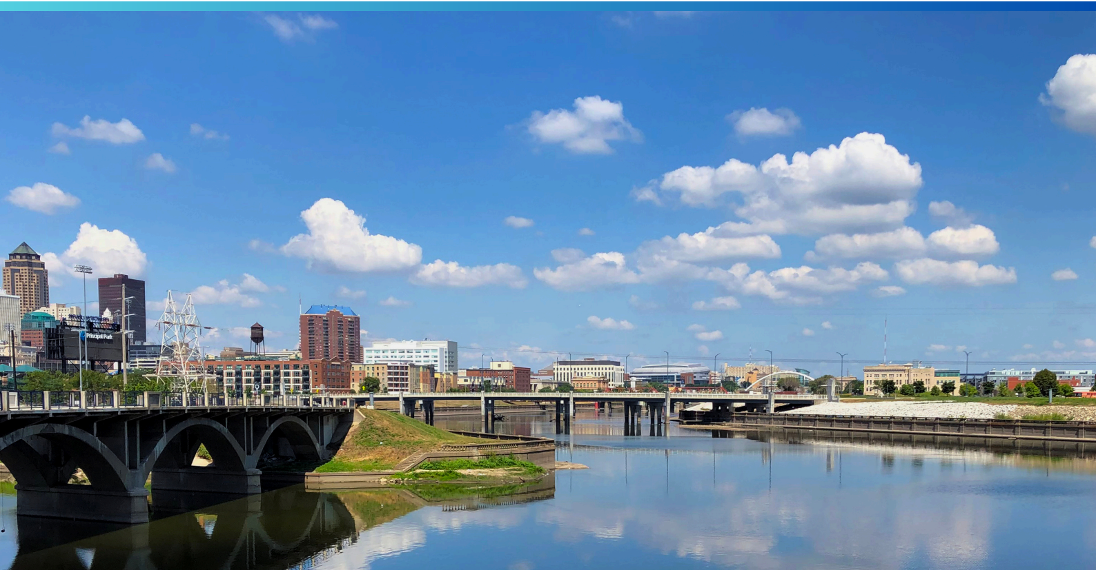
Downtown Des Moines at the confluence of the Des Moines and Raccoon rivers