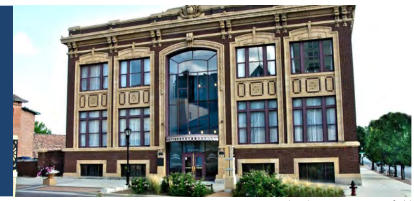
IML headquarters in Springfield

Today, IML membership consists of 1,284 of the 1,294 municipalities in the State of Illinois. It serves as the primary legislative advocate for its members in both Springfield and Washington, DC.